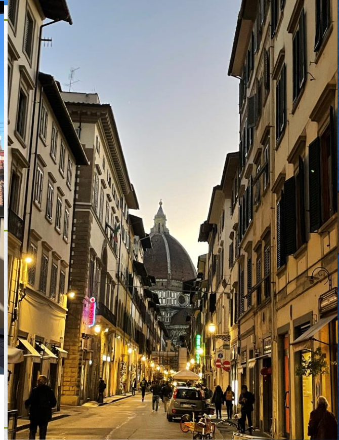
Università degli Studi di Firenze, Włochy.