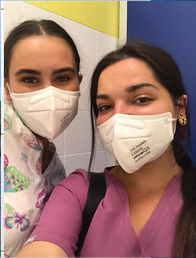
University of Sassari, Italy.